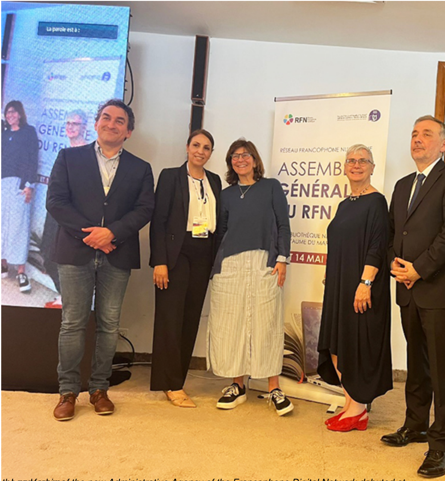
the leadership of the new Administrative Agency of the Francophone Digital Network debuted at