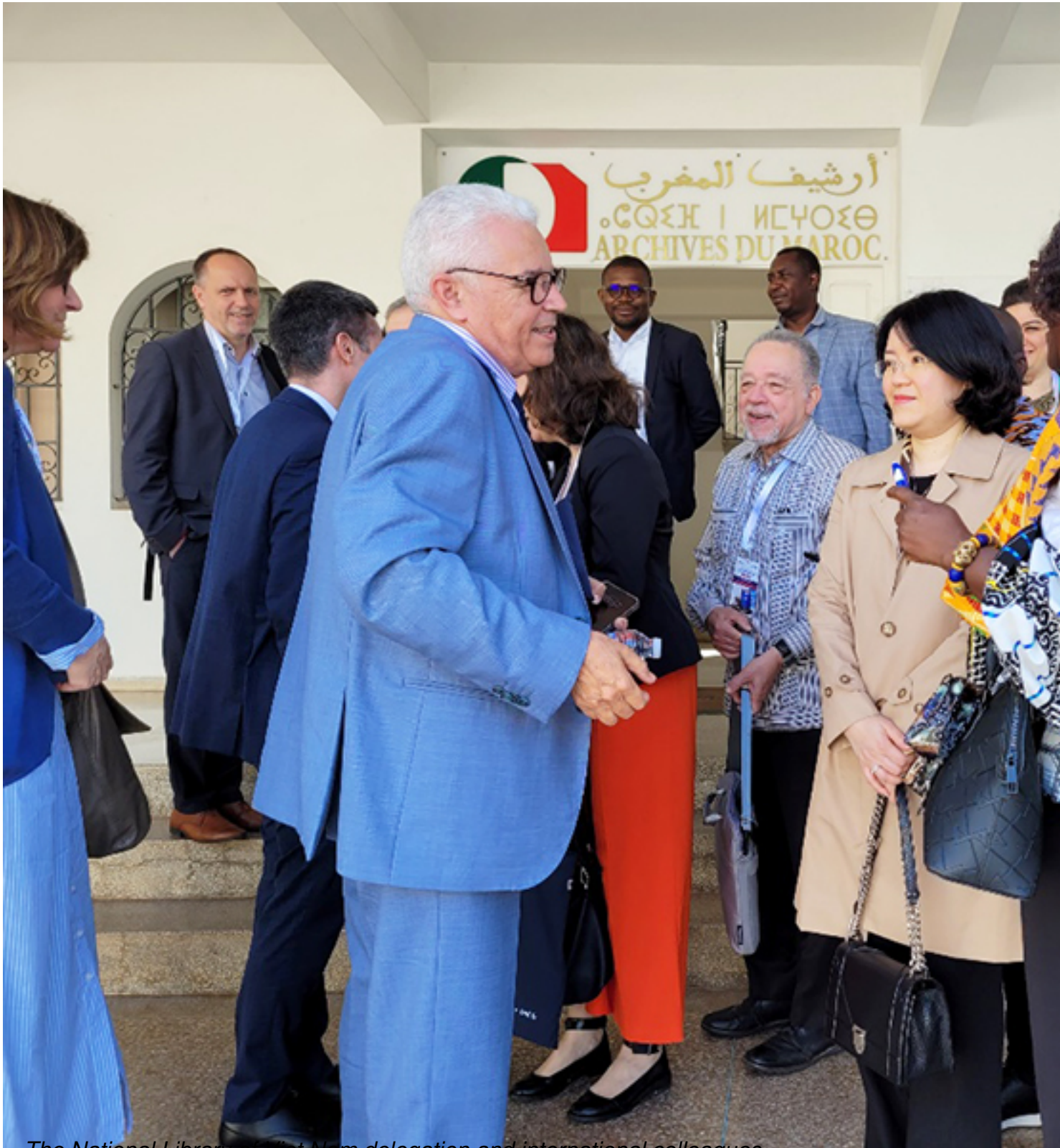
The National Library of viet Nam delegation and international colleagues