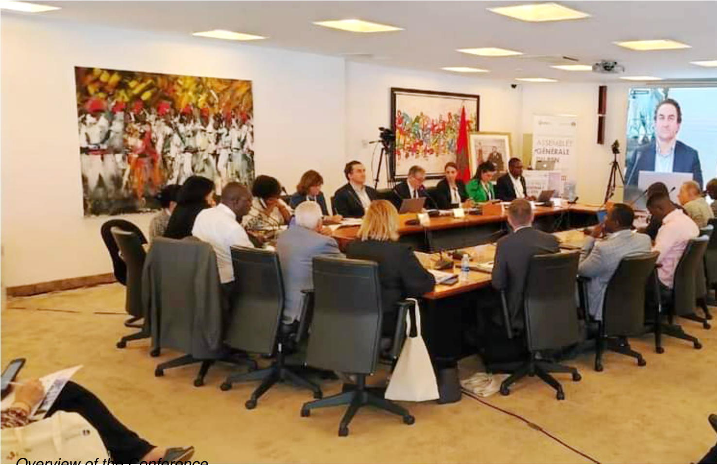
Overview of the Conference