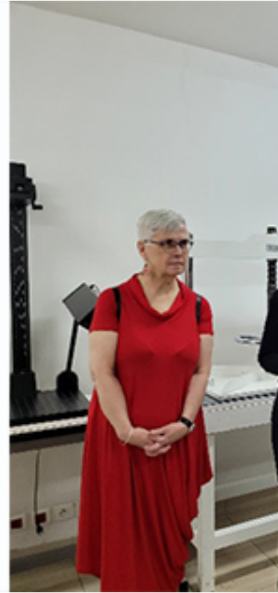
Delegates visited the National Library of Morocco