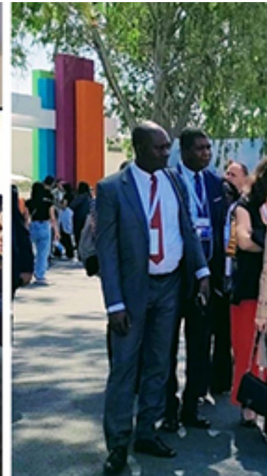
National Archives of Morocco and International Book Fair