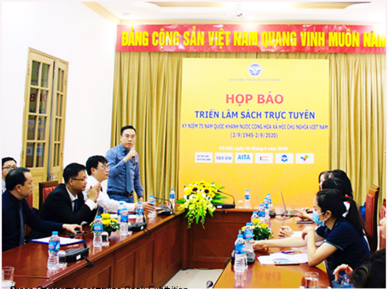
News: Dang Dung ; Photos: Hoang Dung