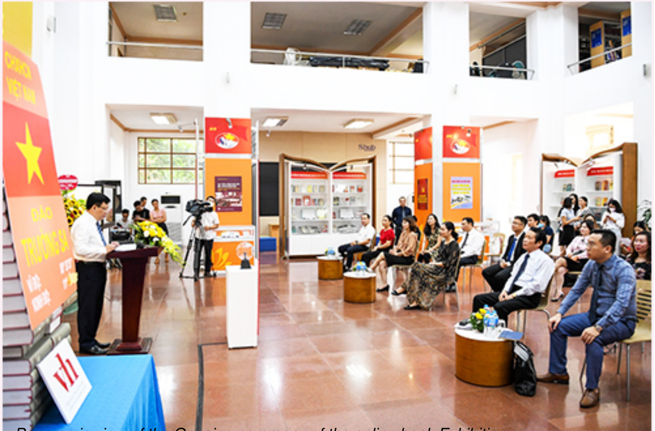
Panoramic view of the Opening ceremony of the online book Exhibition