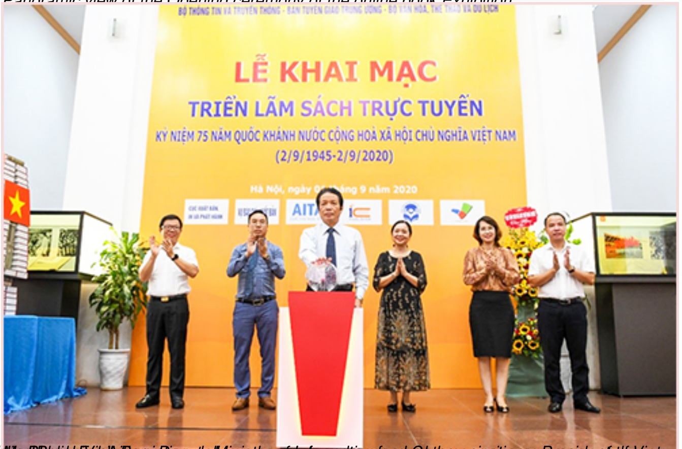
Minister of Information and Communications, Deputy Ministers of Education and Training, Culture, Sports and Tourism, President of the Viet