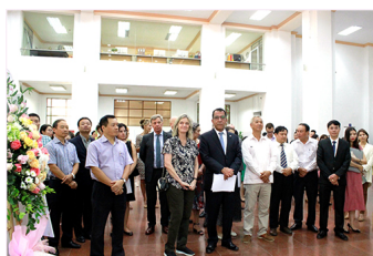
Panoramic view of the Exhibition