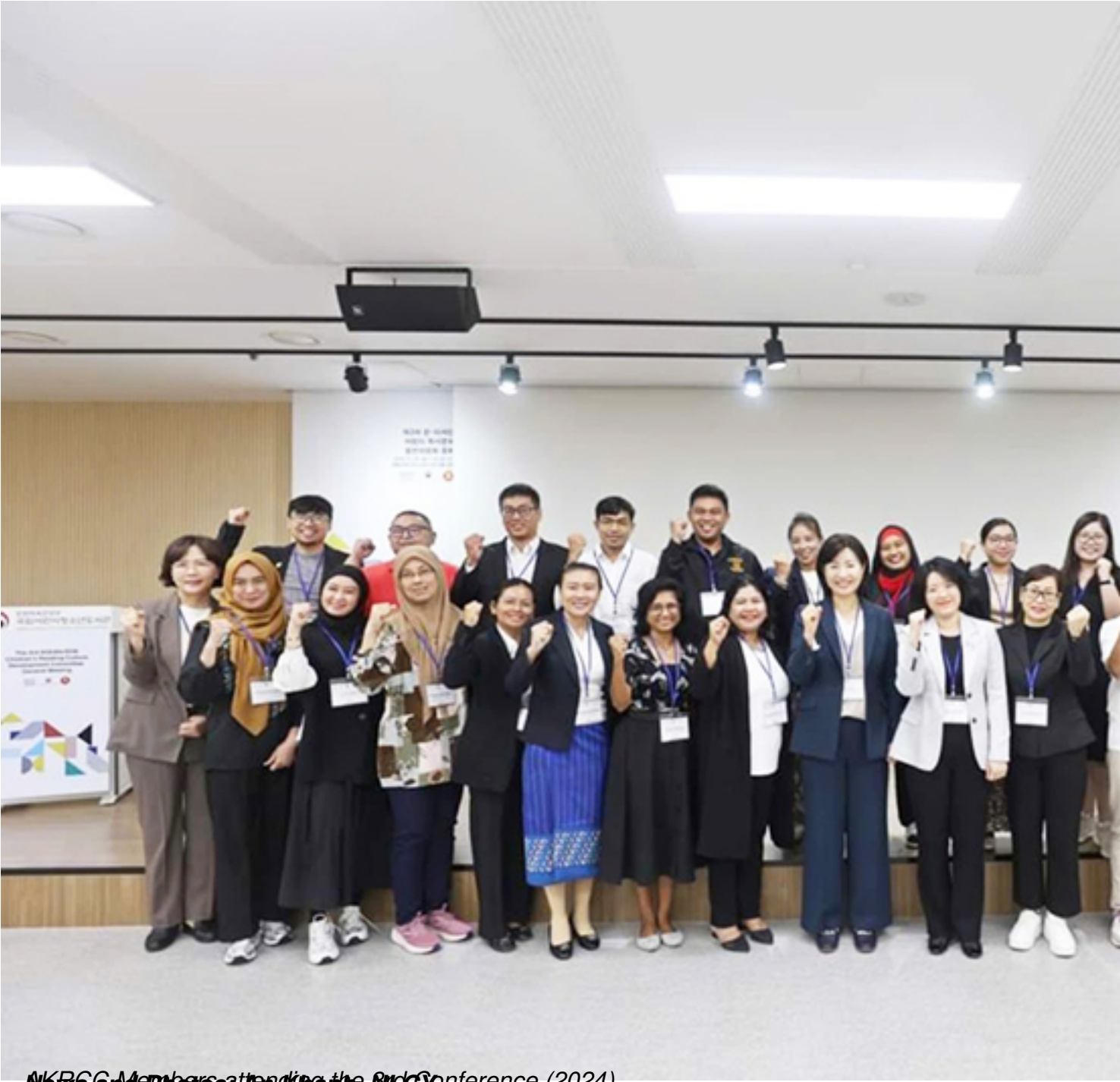
News and Photos: Thank you, NCCS NKRCG Members attending the NCCS Conference (2024)